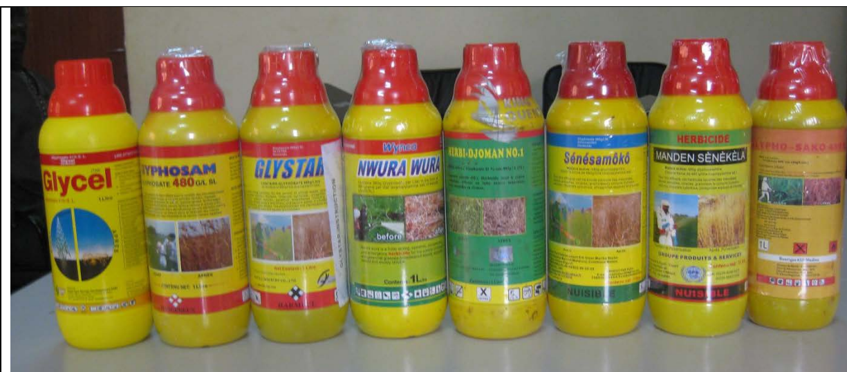
b. Glycel and imitators (above)

Glyphosate prices have fallen in recent years as a result of expiring patent protection for Roundup, increased competition from alternate brands, a move to low-cost Asian manufacturers and increasing efforts by unregistered brands to evade regulatory costs and formal customs duties. Since 2008, Mali's Observatoire du marché agricole (OMA) has tracked herbicide prices across ten major agricultural markets in Mali. The OMA market monitoring data indicate that glyphosate prices have fallen by about 35% in local currency (50% in dollars) among the newer glyphosate brands (such as Kalach), while Roundup prices have declined only slightly in CFA francs (Table 6). Softening prices, in turn, make herbicide uptake increasingly profitable at the farm level, as the following discussion demonstrates.